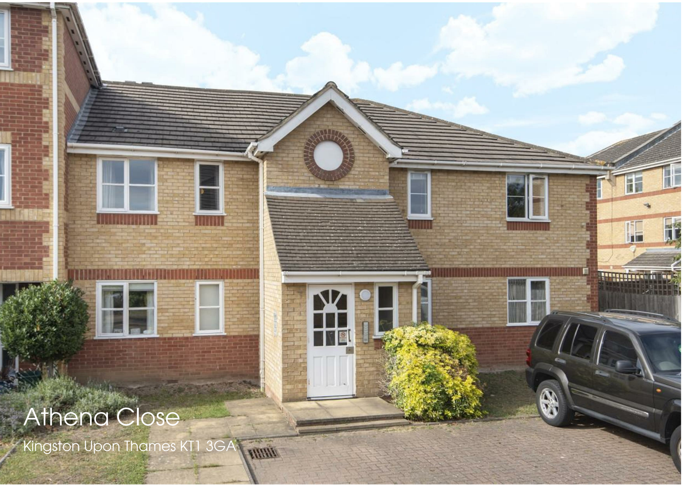
Athena Close Kingston Upon Thames KT1 3GA